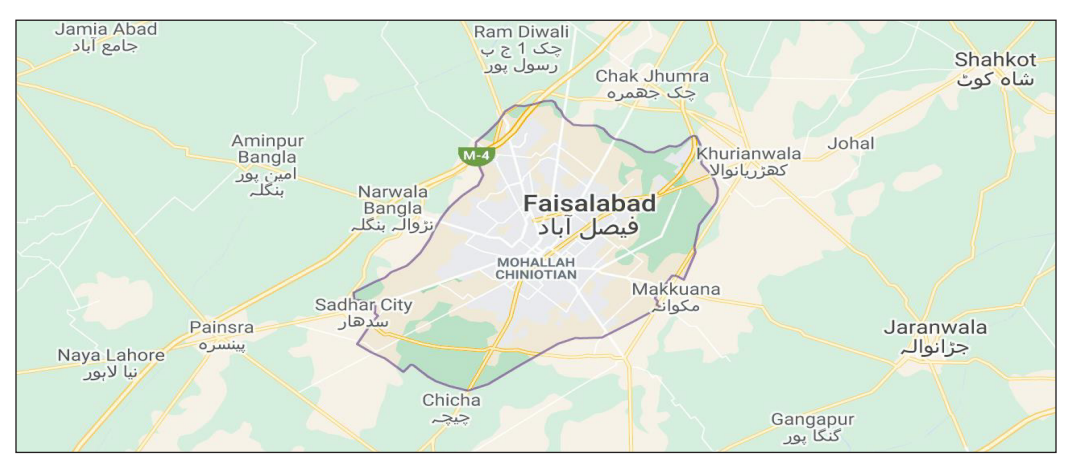
Figure 1. Map of district Faisalabad, Pakistan

The current study, which focuses on the analysis of livelihood diversification of farm families with special reference to decision-making by the women working in textile industries, was conducted in Faisalabad district, Pakistan (Figure 1). The textile sector in Pakistan employs over 15 million people and accounts for 9.5% of the country's GDP. Pakistan is Asia's fourth-largest cotton producer, with the third-largest spinning capacity after China and India. The country accounts for 5% of the global capacity of cotton production. In many developing countries, like Pakistan, women are the primary labor providers in the textile sector, which is notorious for its poor working conditions and lack of worker rights (Mahboob & Anita, 2016). Asia exports 58.4% of all clothes and textiles in the globe (Khan et al., 2020), while textiles involving regional diversity in embroideries may be found in many regions